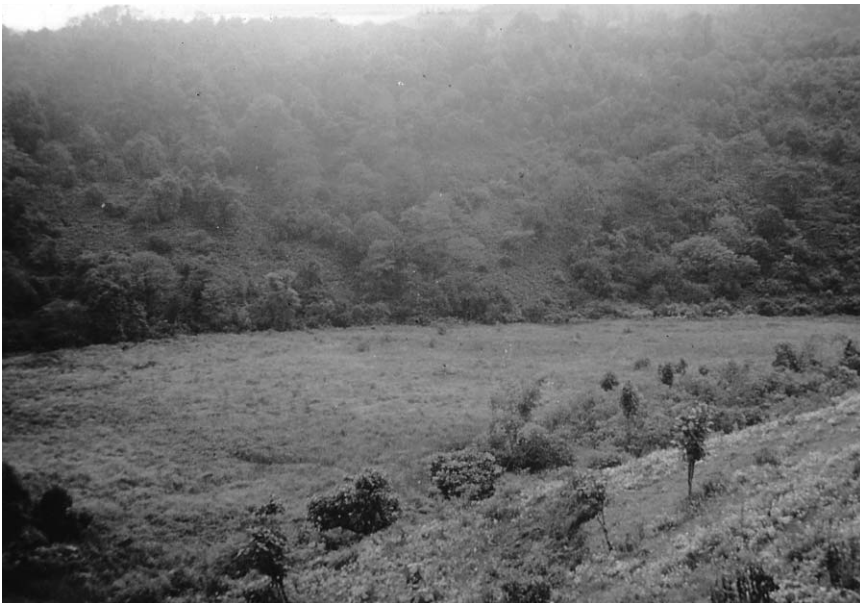
FIGURE 2: The dead Chhojo Lake. Photo by Alka Jain, 1998.

The other legend holds that the lake is called “Chho,” and that many years ago some Bhutia communities had settled around Khecheopalri Lake. They had herds of cattle that grazed in the dense forests around the lake. The lake was called Chholang ( chho =lake, lang =ox) and was sent by the