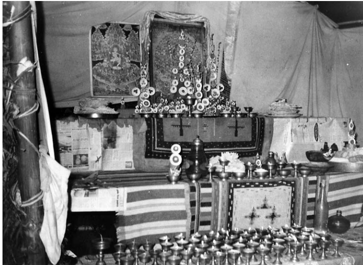
FIGURE 5: Idols of gods and lit lamps during “Bumchu” Festival.

lake, and enjoy the feast together. In the Bhumchu Festival the lake goddess is worshipped in order to maintain peace and harmony in the village for the forthcoming year. Colorful idols of gods made up of flour and butter are seen arranged beautifully with lit lamps and offerings (FIGURE 5). The monks and the local communities perform rites and rituals for three days. Pilgrims generally place prayer flags, which are attached to bamboo poles or small trees ( Symplocos thaefolia and Eurya acuminata ), around the lake. The inscriptions are prayers for the sake of dead relatives, sick people, for the fulfillment of wishes, or for maintaining peace in the family. There are between 11 to 108 flags. These numbers are considered holy in Buddhism and Hinduism: in Buddhist temples there are between 11 to 108 praying wheels and in Hindu rituals the goddess is symbolized by 108 lotus-flower petals. According to the senior citizens of the area, rituals around the lake have been performed traditionally since time immemorial. This festival is a major attraction for the pilgrims of Sikkim and Darjeeling and also from adjoining countries like Bhutan and Nepal. The local community also organizes fêtes where games are played and various stalls selling food, clothing, and other items are opened. Large numbers of holy books, prayer flags, rosaries, and photographs of various gods and goddesses are also sold to generate income