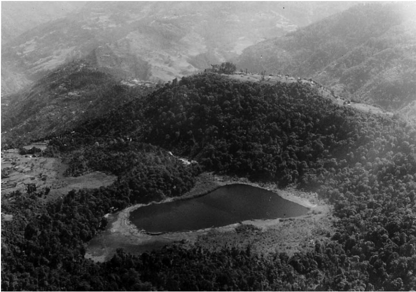
FIGURE 1: Birds-eye view of Khecheopalri Lake and surrounding areas.

The present study summarizes basic information on biofolklores of Khecheopalri Lake in order to revive and reinforce its sacredness and encourage conservation for the sake of future generations.