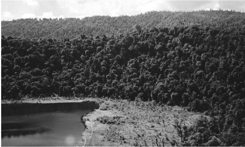
FIGURE 3: Thick and luxuriant forest growth around Khecheopalri Lake.

lake goddess (FIGURE 3). One day a white holy ox emerged from the lake and started to graze around the lake. It finally mingled with the herd of cattle that belonged to the Bhutias. When the Bhutia owner noticed the foreign animal in his herd, he tried unsuccessfully to locate its owner. He then slaughtered the animal for its meat and was surprised to notice that a milky discharge oozed out instead of blood. He washed the discharge, cooked the meat, and had a great feast with his friends. After that he began to notice that all his cattle and those belonging to the Bhutia community in the locality started to vanish one by one due to strange ailments. It is believed that in this way the entire Bhutia community vanished from Khecheopalri Village. These days, mostly Lepcha settlements are found around Khecheopalri Lake and only a few Bhutias who married Lepchas are believed to have survived the dreadful curse.