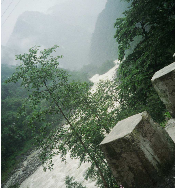
River Teesta traversing down its valley in its upper reaches, North Sikkim

Sikkim Himalaya has been bestowed with some of the outstanding natural features. Availability of water resource in the form glaciers, lakes, rivers and streams, and natural springs is one such example in this respect. Sustainable utilization of this natural endowment becomes critical in a Himalayan State like Sikkim.