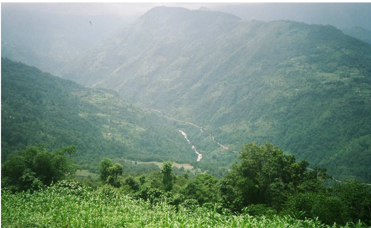
General View of the middle hills in Sikkim Himalaya (photo-vimal khawas, June, )

The State of Sikkim is a small geographical entity located in the Eastern Indian Himalayan Mountain System. Completely landlocked and criss-crossed by green valleys, high peaks and rippling rivers the region is bounded on the north by China (Tibetan Plateau), Bhutan and Tibetan Plateau on the east, Nepal on the west and the Darjeeling Hills of West Bengal on the south. The entire Sikkim Himalaya is a part of the youngest and loftiest mountain system of the world ‘the Himalaya’ and hence is characterized with highly folded and faulted rock strata at many places. Covering just 0.2 percent of the country the state is characterized with formidable physical features.